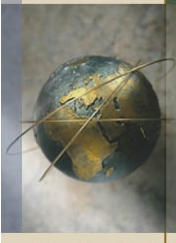
Internationalized Domain Names (IDNs)