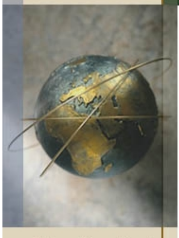
Internationalized Domain Names (IDNs)