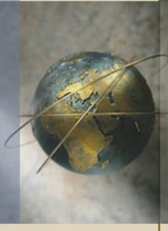
Internationalized Domain Names (IDNs)