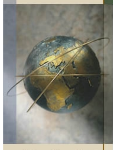
Internationalized Domain Names (IDNs)